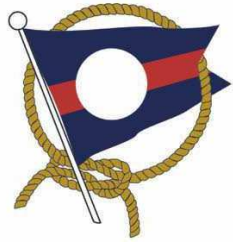
Laguna Woods Yacht Club